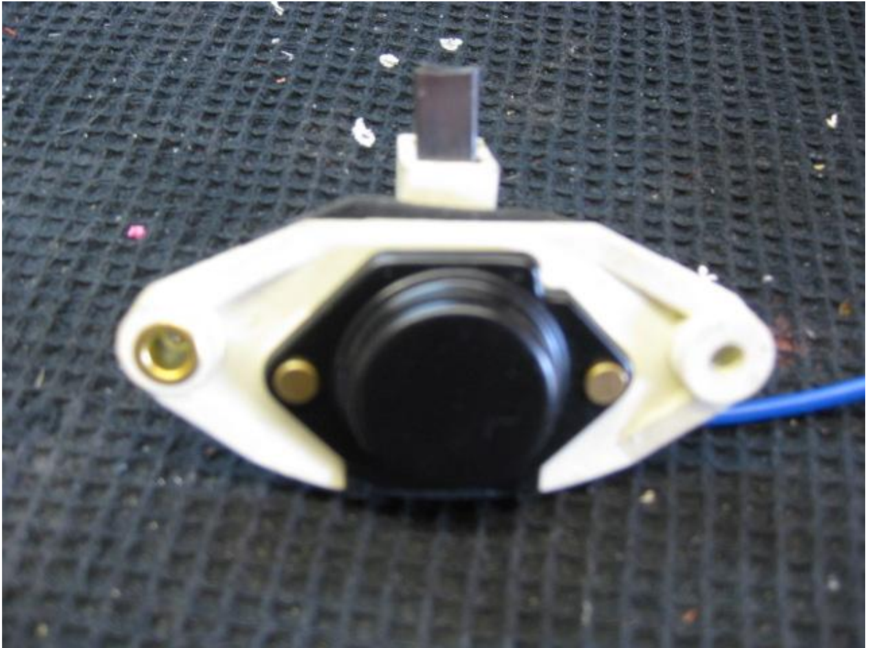
Bosch Regulator late model type